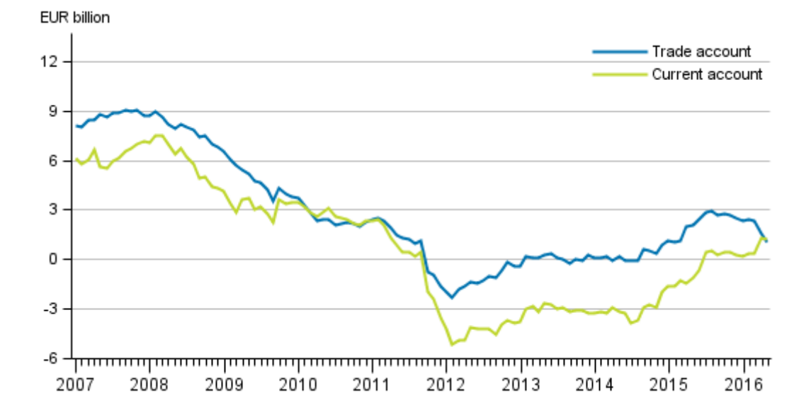
Finland's current account and trade account, 12 –month moving sum

The primary income account was EUR 0.3 billion in surplus. The primary income account includes investment income like interests and dividends. The secondary income account was EUR 0.2 billion in deficit.